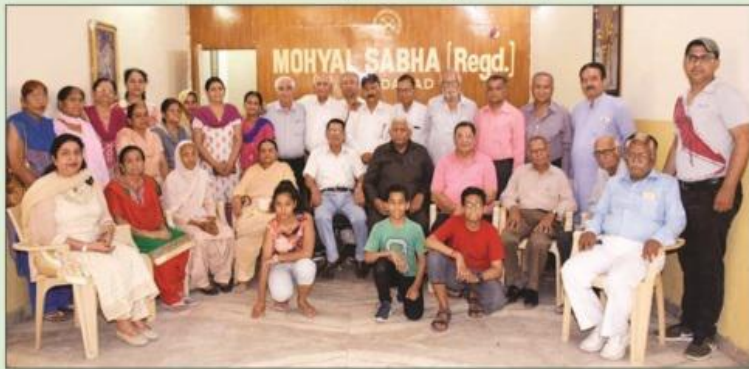
MS Faridabad Monthly Meeting on 7 April 2019