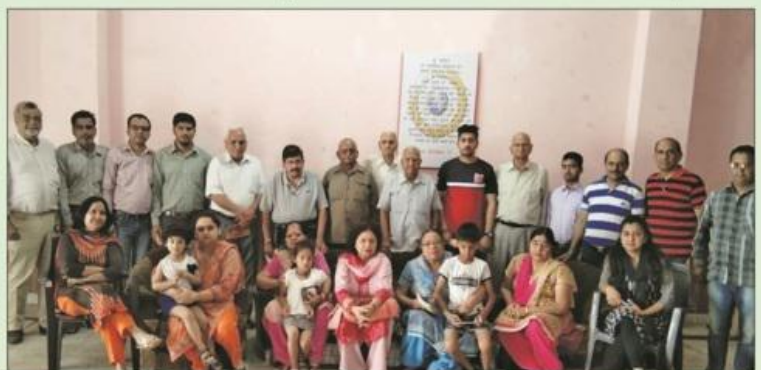
MS Ambala City Monthly Meeting on 7 April 2019