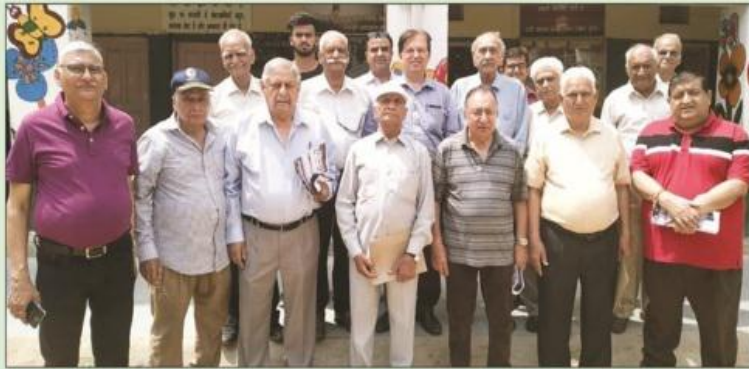
MS Gurgaon Monthly Meeting on 7 April 2019