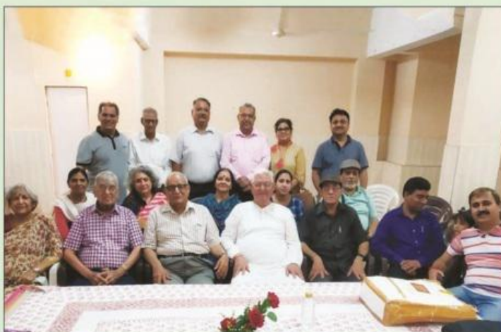
MS Rohini Pitampura Monthly Meeting on 21 April 2019