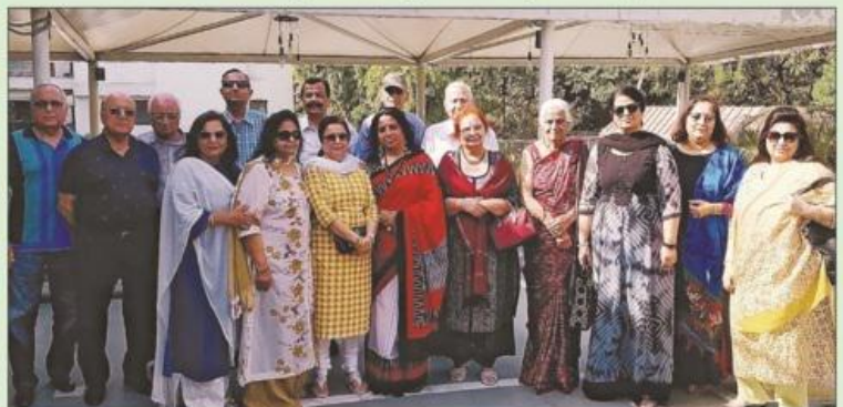
MS South Zone Monthly Meeting on 24 March 2019