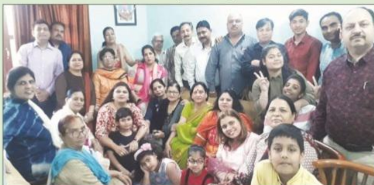
MS Panipat Monthly Meeting on 24 March 2019