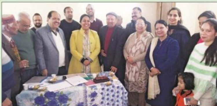
MS Mehrauli Monthly Meeting on 7 March 2019