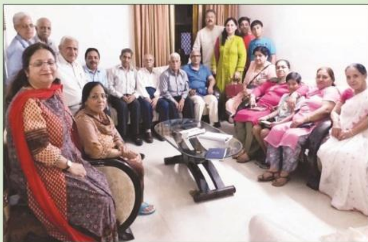
MS Paschim Vihar Monthly Meeting on 31 March 2019