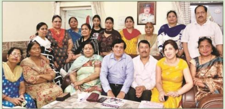
MS West Zone Monthly Meeting on 7 April 2019