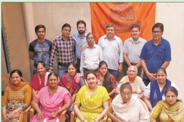
MS Yamuna Paar Monthly Meeting on 7 April 2019