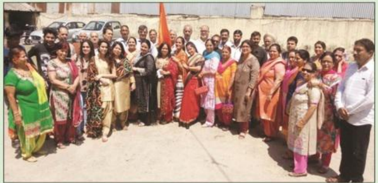
MS Dehradun & MS Prem Nagar Dehradun celebrated Baisakhi on 21 April 2019