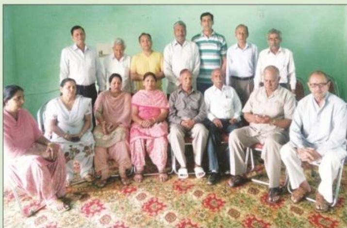
MS Jagadhari Workshop Monthly Meeting on 7 April 2019